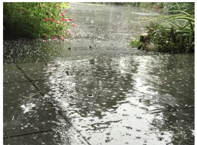
A one shot loss is better than having to play in this!!!