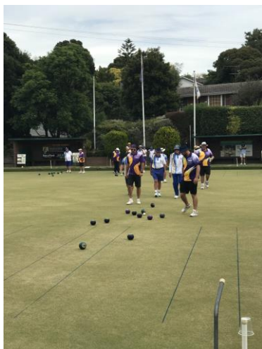
Action Shots on the 20/3/21