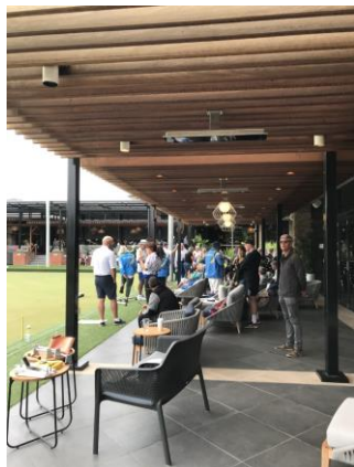
Supporters at Mulgrave Country Club