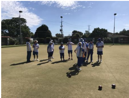
Midweek side 1 at Clayton

After our remarkably close win over Buckley Park, Side 1 played in the Division 3 Semi-final on Saturday 10th April for the chance to play in the Divisional Grand Final. The Semi-final was played at MCC against the team from Doncaster alongside the other Division 3 Semi-final between Dandenong Club and Whittlesea. The weather in the morning did not look to good as we had periods of rain and strong wind however, by the time we all arrived at MCC, things had calmed down a little, though we did get a brief shower just before we started the