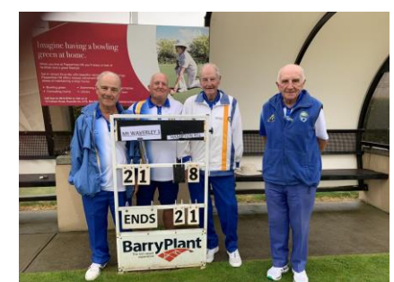
The winning rinks