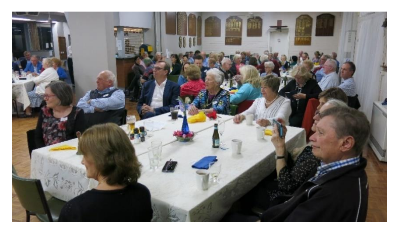
Members and guest enjoying the presentations.