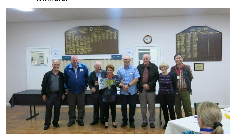
Tuesday pennant winners (some of the team members)

Midweek Pennant Team 1 – Division 2 Section 8 winners.