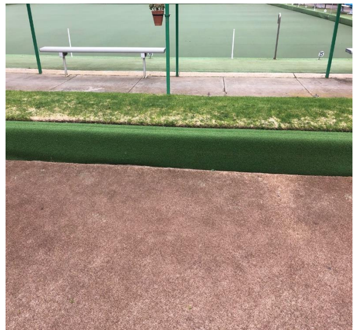
Replaced Centre Green Surround