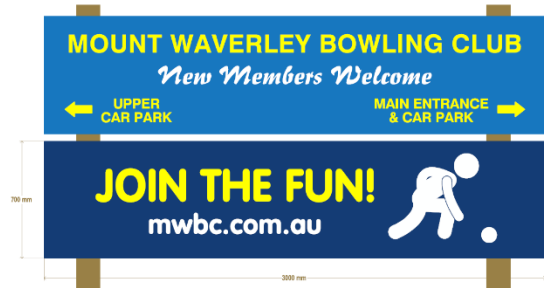
Top of High Street Laneway

When you are next out driving on High Street or Wadham Parade, please keep an eye out for our new road signs (shown below).