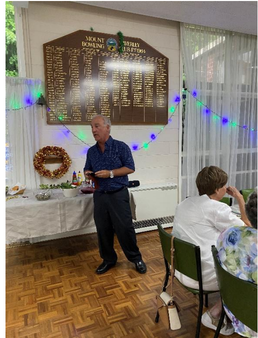
One of our wonderful karaoke singers