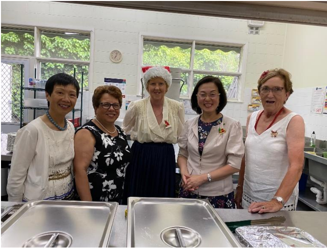
Federal MP Gladys Liu with some of our amazing volunteers