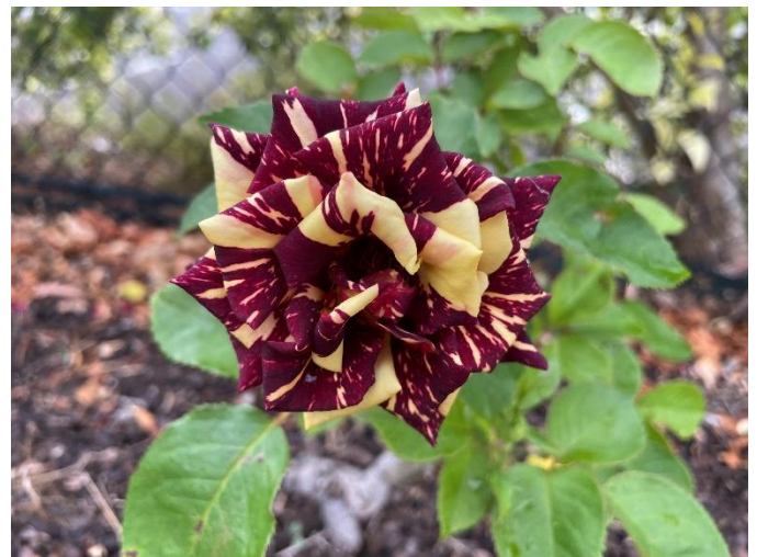
Abracadabra Rose found in club rose garden.

If you are interested in purchasing, please contact info@mwbc.com.au to organize a collection time for the freezer.