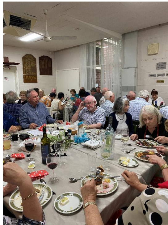
Some of the club members enjoying their meal