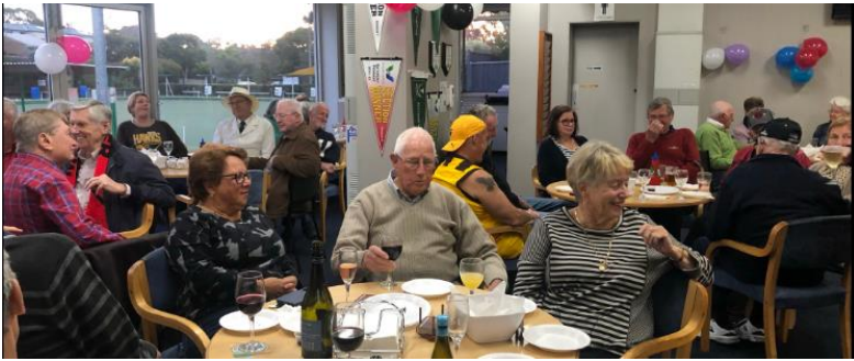
Members and guests enjoying our first Friday Super Social

Bring your Partner, a Friend or Neighbor