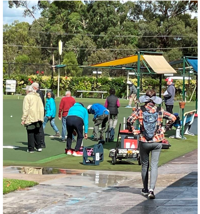
Some of the new U3A bowlers