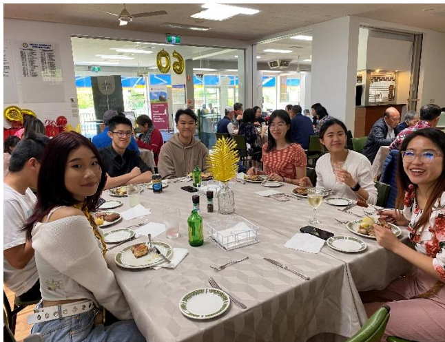
One of the tables of the birthday guests

If you have a working with children's card, it needs renewing after 5 years. You should get a reminder email 28 days before it expires. It is worth checking the date it expires though. Renewal is available online. If you have renewed your working with children, don't forget to let the club secretary know.