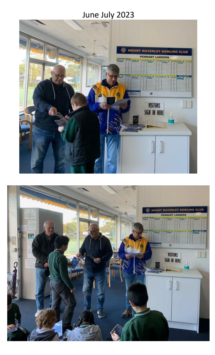
June July 2023