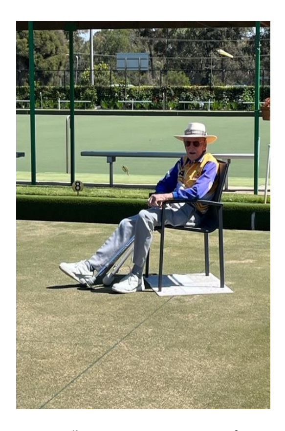
Bruce still participating at 97 years of age.