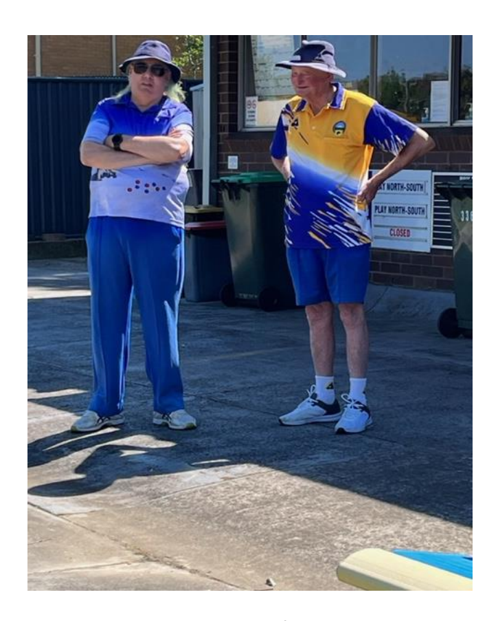
The green looks better from back here.