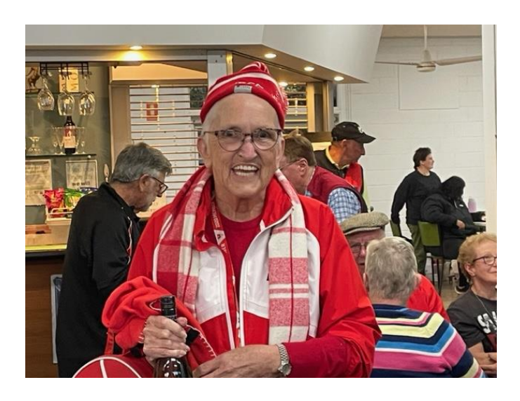
Presentation of the volunteer tops. A big thank you to our sponsor Jellis Craig