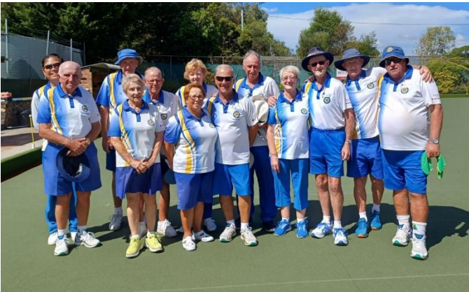
Our Midweek Preliminary finalist Side 1

Midweek Pennant Sides in Div 2 and Div 5 also had great seasons with both finishing in the top 4 of their respective Sections. Side 1 had a first up win over Glen Waverley in the semi-final but just went down to a strong Heathmont yesterday in the Pre-lim. Side 2 played Cardinia Waters in the Semifinal at home but couldn't reproduce the form they had just 2 weeks ago when they beat them by 40 odd shots, the Side losing by 5 shots in a very close game.