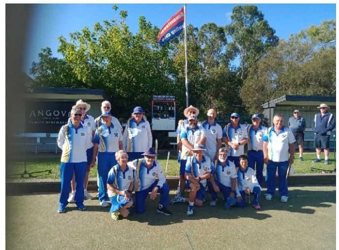
Our Side 2 winning the Sectional Grand Final against Armadale