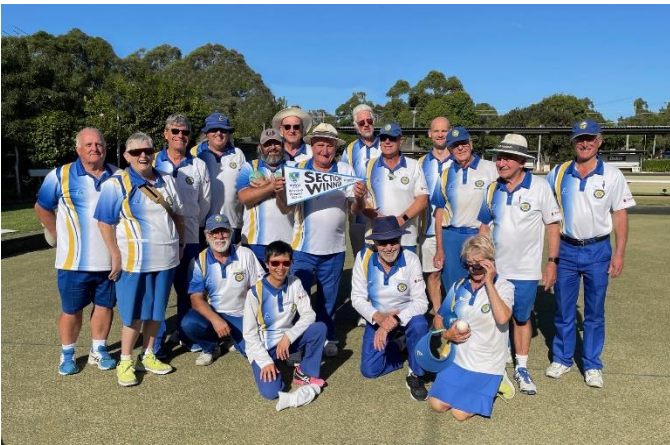
Our Side 2 with the Sectional Final flag!

Midweek Pennant Sides in Div 2 and Div 5 also had great seasons with both finishing in the top 4 of their respective Sections. Side 1 had a first up win over Glen Waverley in the semi-final but just went down to a strong Heathmont yesterday in the Pre-lim. Side 2 played Cardinia Waters in the Semifinal at home but couldn't reproduce the form they had just 2 weeks ago when they beat them by 40 odd shots, the Side losing by 5 shots in a very close game.