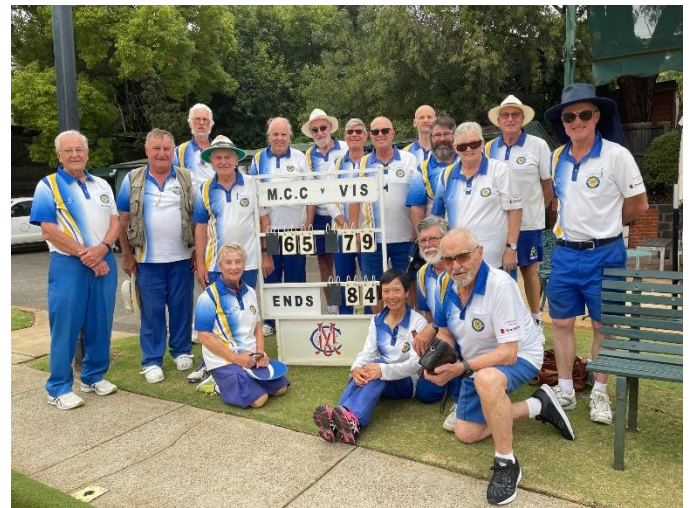
Our Side 2 winning the Sectional Preliminary Final

The Club has performed very well in the pennant competitions with 4 of the 5 sides competing making it into the finals. Our Weekend Pennant sides in Div 2 and Div 5 had very different seasons. Side 1 in Div 2 struggled this season and unfortunately finished in the relegation position and will be playing in Div 3 next season, a time to re-build and re-new. Side 2 in Div 5 had a wonderful season and will play off in the Sectional Grand Final tomorrow at Bennetswood Bowls Club. This means that the Side will move up to Div 4 next season. I am sure that we will have lots of club supporters to cheer the team on.