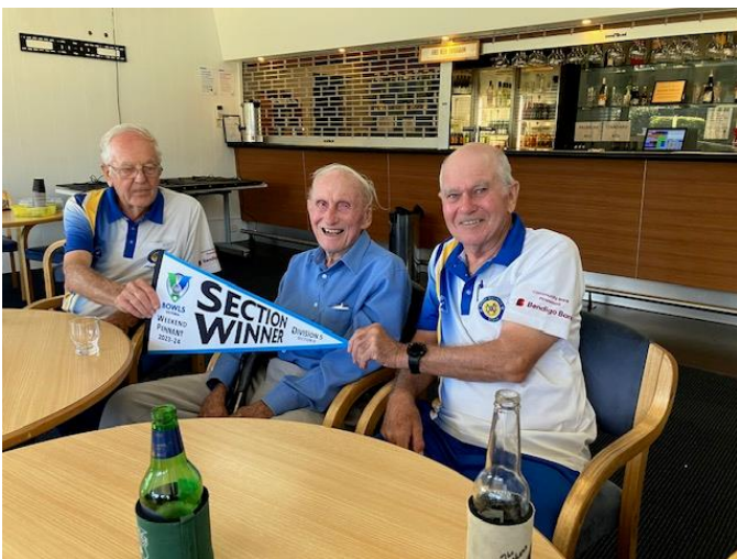
The three Bruces with the Saturday Side 2 Section flag.